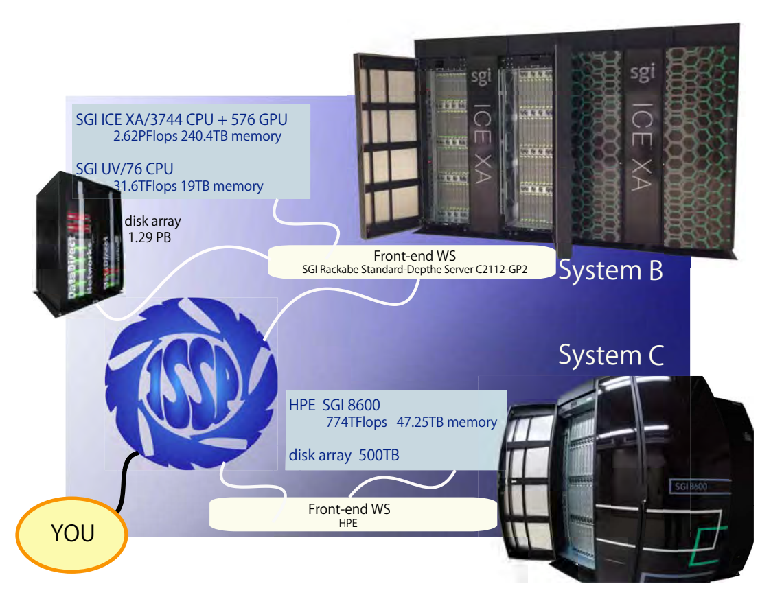
Figure 1: Supercomputer System at the SCC-ISSP

In addition, from SY 2016, ISSP Supercomputer is providing 20% of its computational resources for Supercomputing Consortium for Computational Materials Science (SCCMS), which aims at advancing parallel computations in condensed matter, molecular, and materials sciences on the 10-PFlops K Computer and the exascale post-K project. Computational resources have also been allotted to Computational Materials Design (CMD) workshops, as well as for Science Camps held in ISSP for undergraduate students.