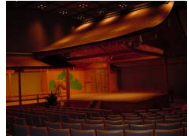
Some of the oral presentations will be made in Noh Theater. (Noh is traditional theatrical performance art.)