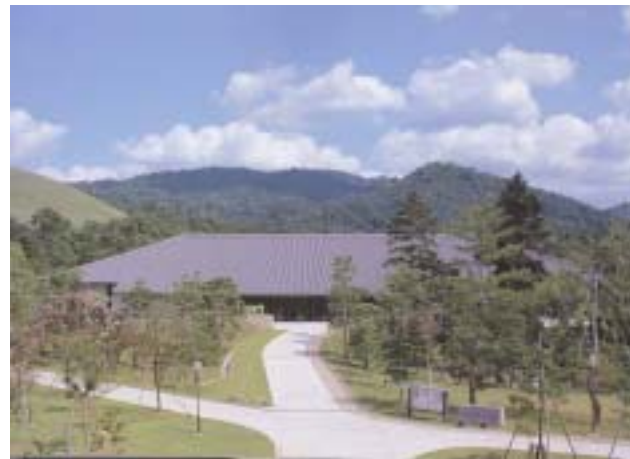
Nara New Public Hall (Shin-Kokaido)

The conference site, Nara New Public Hall, is located in Nara Park, about 25 minutes on foot or about 10 minutes by bus from downtown Nara. Nara is one of the most historically important cities in Japan, located about 35 kilometers east of Osaka or south of Kyoto. It was the location of the capital of Japan in ancient times, 710-784A.D. Many important designated Cultural Assets and National Treasures can be found there, as well as temples, shrines, statues, carvings and paintings. In Nara Park, nature and history are beautifully preserved as they are, which include Todai-ji Temple, Koufuku-ji Temple, and Kasuga Grand Shrine. Nara park is also famous for its hundreds of tame deer that roam freely.