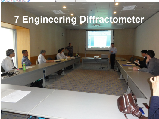
7 Engineering Diffractometer