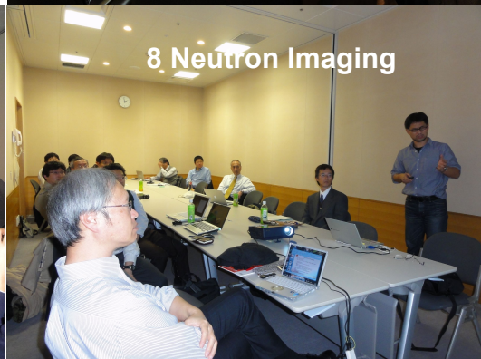
8 Neutron Imaging