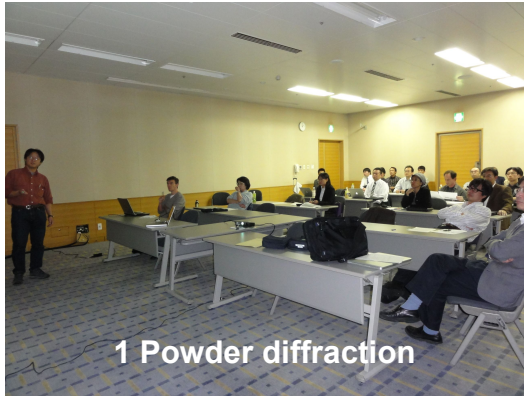
1 Powder diffraction