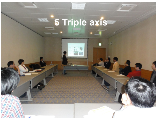
5 Triple axis