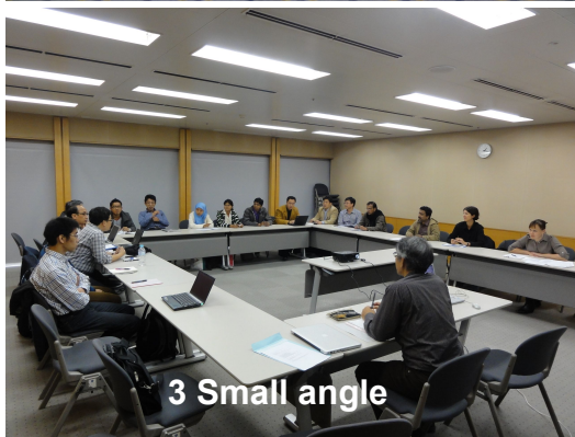
3 Small angle