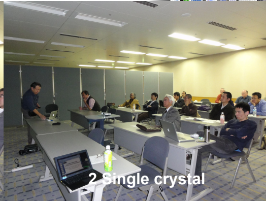
2 Single crystal