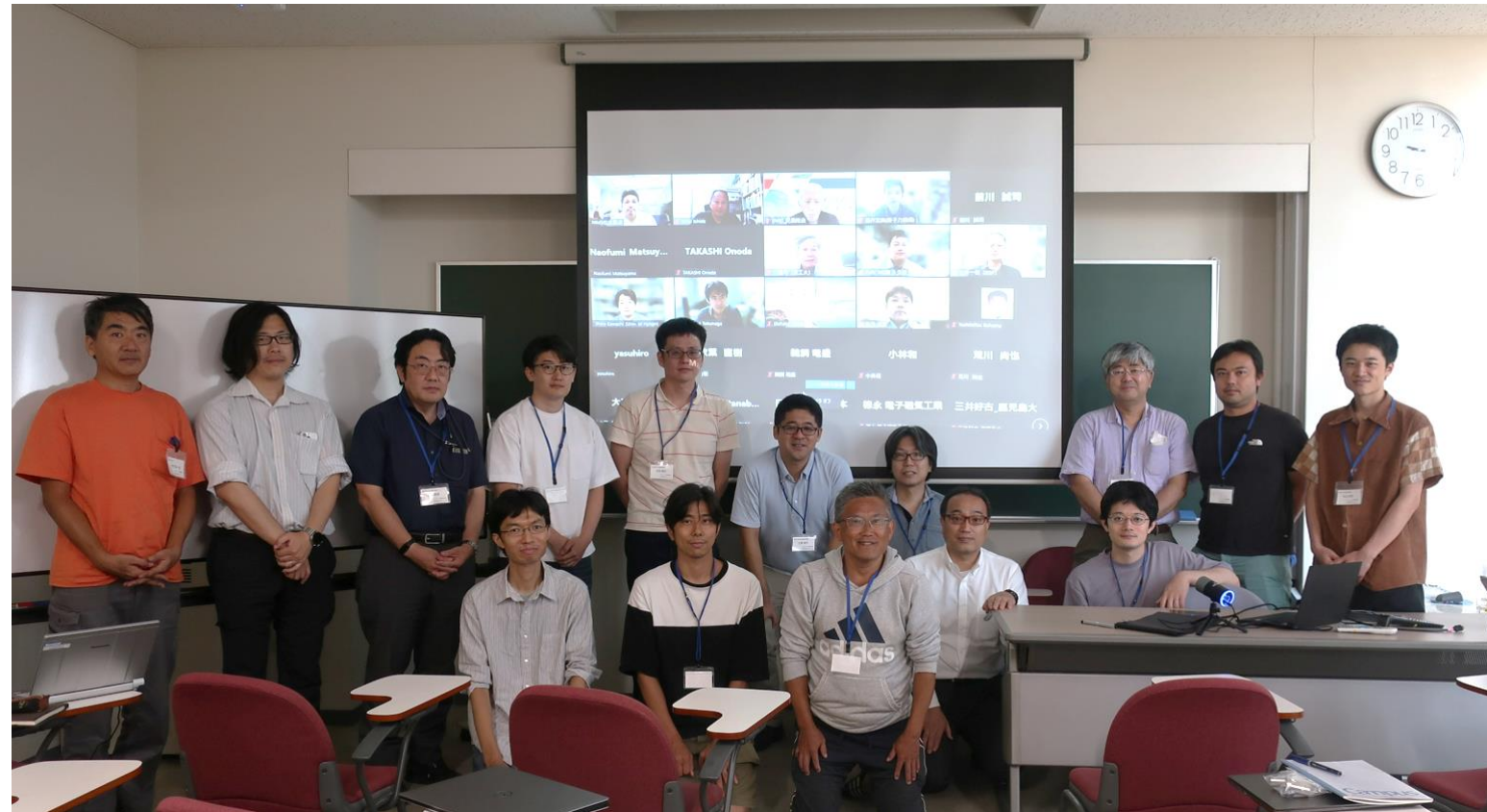
We held a meeting about the long-pulse magnetic fields.