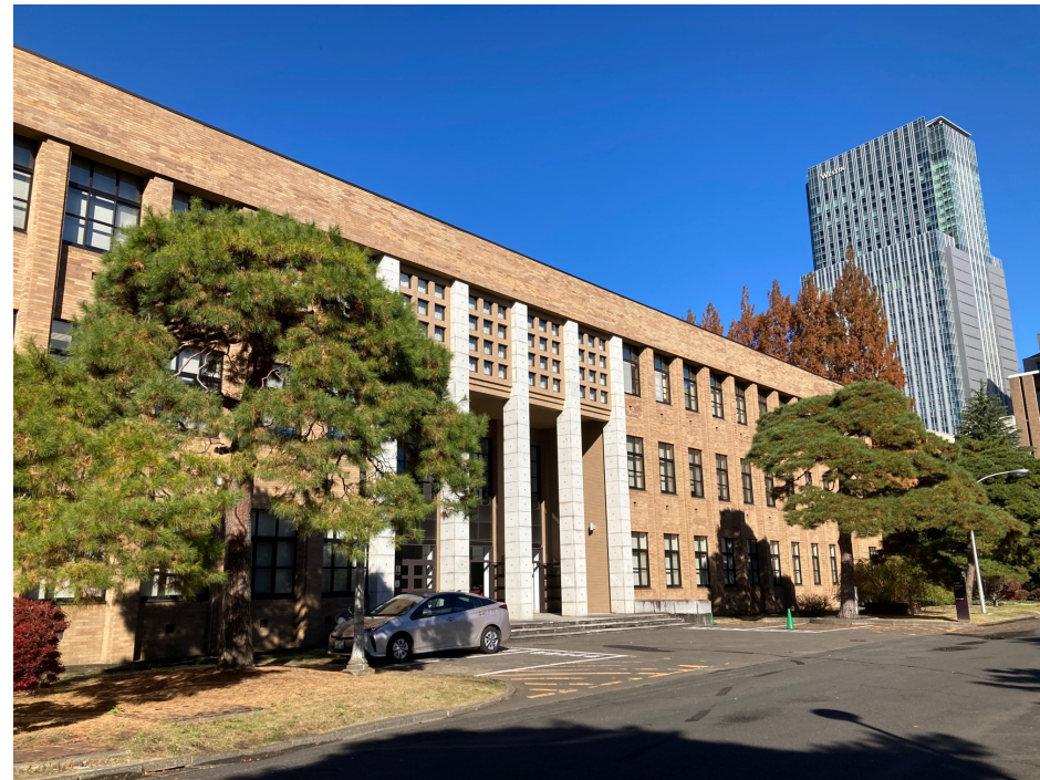
The conference sign-board at IMR, and the main administration bureau of Tohoku University at the Katahira campus.